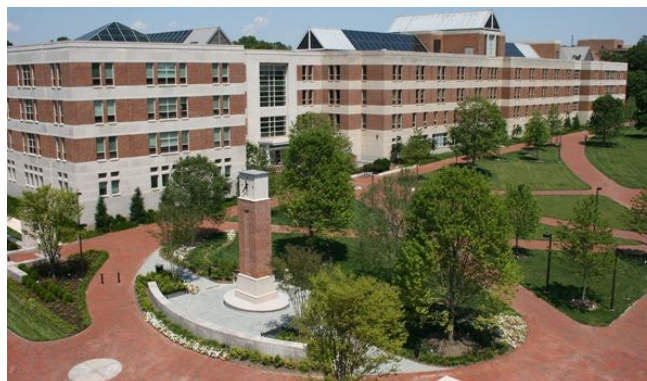
Van Munching Hall 7621 Mowatt Lane College Park, MD 20740

*All areas are categorized by state/district and are written in alphabetical order, not in order of recommendation.